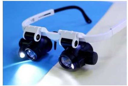
Say Goodbye to Handheld Magnifiers, step into a New Era of Magnification