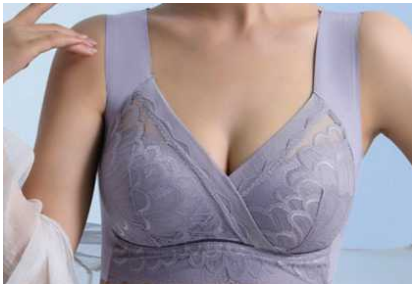
A 60-year-old Granny Made a Bra for Elderly Ladies That is Popular All Around