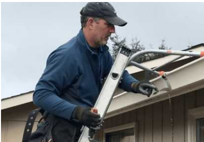
How Much Does It Cost to Install Gutter Guards in 2023?