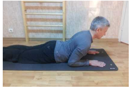
Have an Enlarged Prostate? Urologist Reveals: Do This Immediately (Watch)