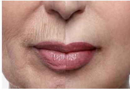
This "Botox in a Bottle" Sold out at Target (In 2 Days)