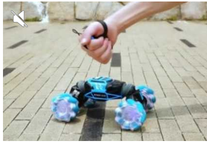
The Coolest Gift for kids' Birthdays and Holidays