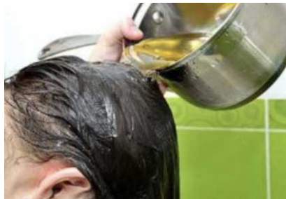
Doctor: Do This to Promote Hair Regrowth