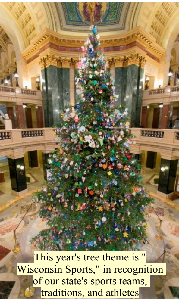
This year's tree theme is "Wisconsin Sports," in recognition of our state's sports teams, traditions, and athletes