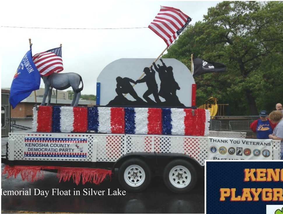
Memorial Day Float in Silver Lake