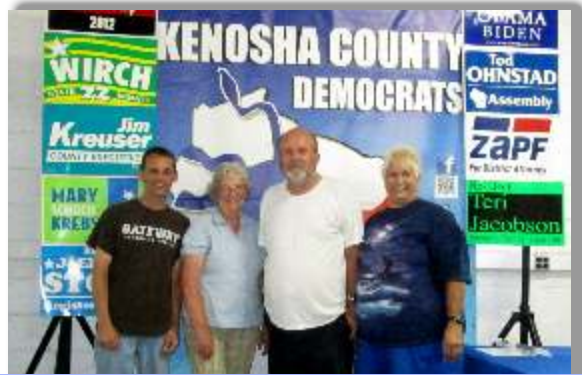
County Fair Booth Setup Day