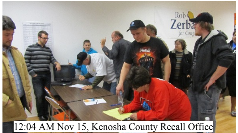
12:04 AM Nov 15, Kenosha County Recall Office